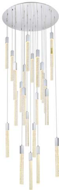
Chrome Item No: 2066G42C