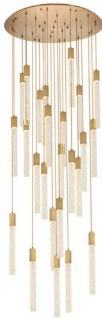
Stain Gold Item No: 2066G42SG